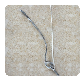
2. Connect the pigtails to the control bar with a larks head, as shown in the pictures above.