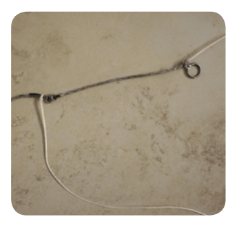
6. To shorten the flying lines, take all new steel rings and walk them back towards the bar. Use the pigtails to connect the steel rings to the control bar. Fix them using a larks head knot.