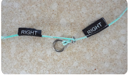
3. Disconnect all back- and front lines from the kite. Pull each line through the small ring and one steel ring from the kit. Connect each line to the larger steel ring with a larks head knot.