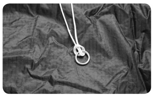
4. Disconnect the white reef line at the Y-bridle. Place one ring from the kit over the two lines coming from the kite and fix them using a larks head knot.