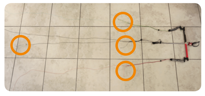
1. Connect all four pigtails at the highlighted spots on your control bar.